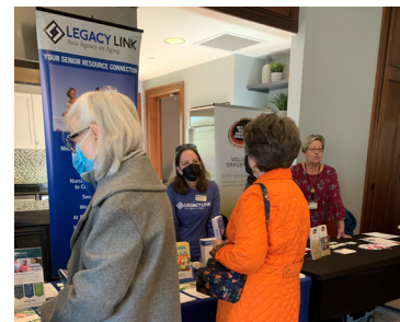
Hall County community members stopped by the Legacy Link AAA booth to learn more about services and volunteer opportunities.