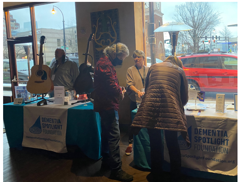
DAS resources and information was provided to guests at the Alzheimer's Music Fest.