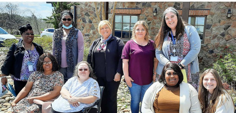
The Northwest Georgia APS team took time to relax and enjoy time together.

APS team members across the state celebrated Social Work Month in March with crafts, food and team-building activities.